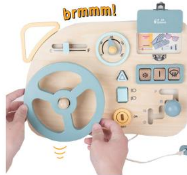
modern one-piece wooden toy

The one I had was much more sophisticated and realistic. I cannot recall the product name ('Junior Driver' or something like that?), but I am certain that it was made in Britain, probably by Merit or Chad Valley or one of the other renowned toy companies of the day. The plastic steering wheel, which was mounted on a hard-rubber steering column with splines along its length, had a movable column-shift gear lever. That component was EXACTLY like the item seen in the left-hand image above – except for the colours. Marketed in Australia circa 1978, but without the elaborate dashboard component, the toy in the left-hand image was almost certainly manufactured in somewhere like Hong Kong, probably using the same moulds/dies used to produce the steering wheel/gear lever component of the British toy I had.