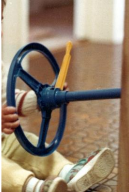
Toy steering wheel and column shift lever_1978 (NB: in the attached jpg image, the suction cap is 'out of shot', attached to a door or wall.)

I am hoping you could assist in my search for information about and illustrations of a toy I had in the late 1950s /early '60s. It was a steering wheel-and-dashboard outfit, almost entirely of plastic construction, that could be attached to the dash/glove box of an actual car, and was similar, in basic concept at least, to this modern one-piece wooden toy at the right below