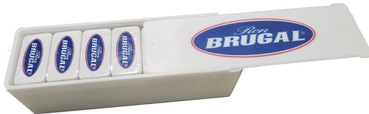
Ron Brugal Domino Set (with unopened stacks of dominos)