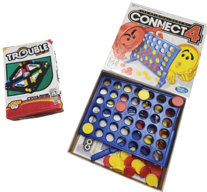
Left to Right: Pop-O-Matic Trouble by Hasbro Connect 4 by Hasbro