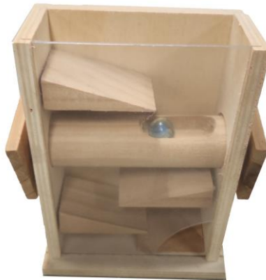
Wooden Ball Drop by Horizon Group USA Inc (made in China) (Ball is dropped in top left and comes to rest in cylinder. Cylinder rotated by means of the two square ends, dropping ball into cylinder Ball rolls down the two ramps and exits opening at right front)