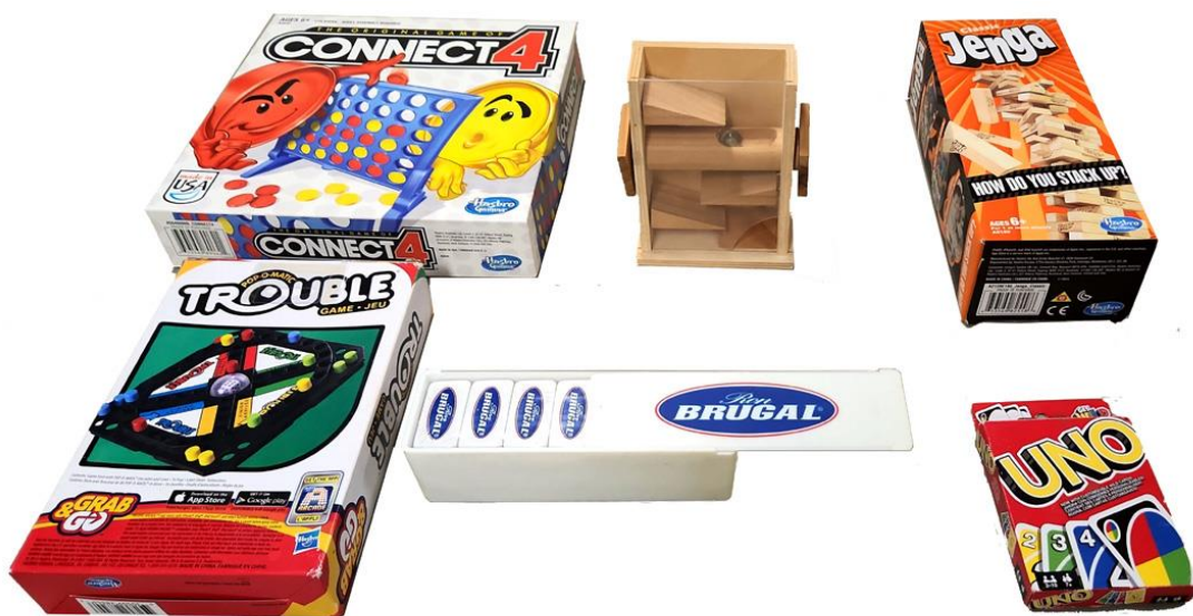
A Selection of Games Played At The Table