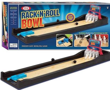
Rack N' Roll Bowling Game with box by Ideal

I can be contacted at brianrea@telus.net