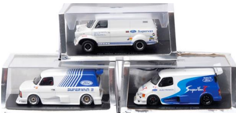
Above: Supervans 1,2, and 3 ...