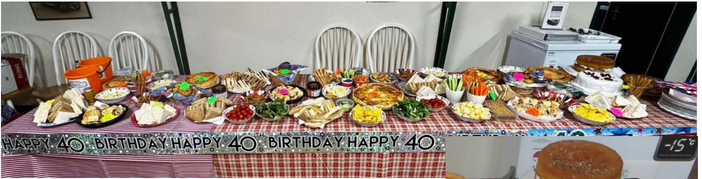
Ricky's super buffet... including these three tasty cakes! >>