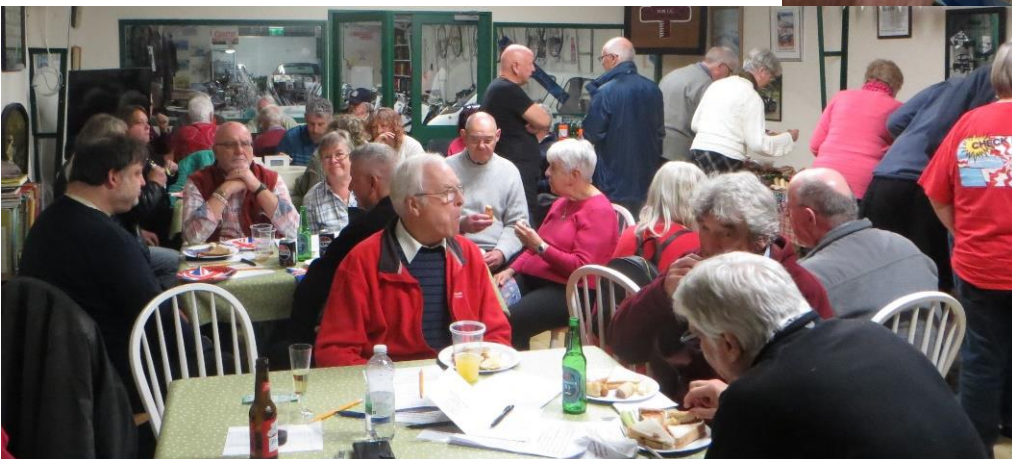
Getting down to the serious business!