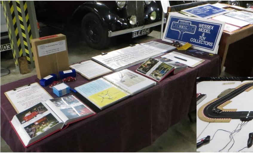
<< The club display