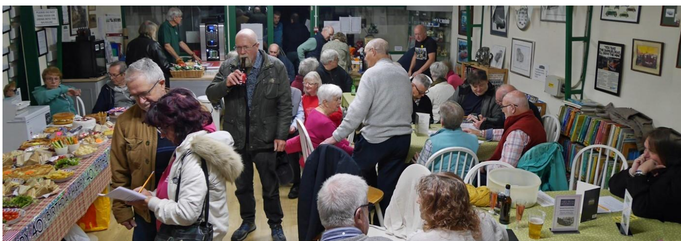
Another view of the assembled multitude!

It really was a super night, with a wonderful atmosphere... As Elvis sang, back in 1960 – "What a night, oh what a night it was, it really was, such a night...!" (Remember that one...?)