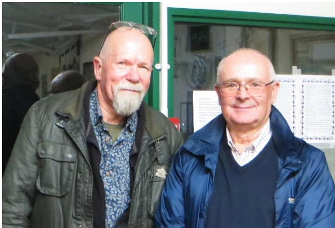
The ones to blame for getting it all started! ^^