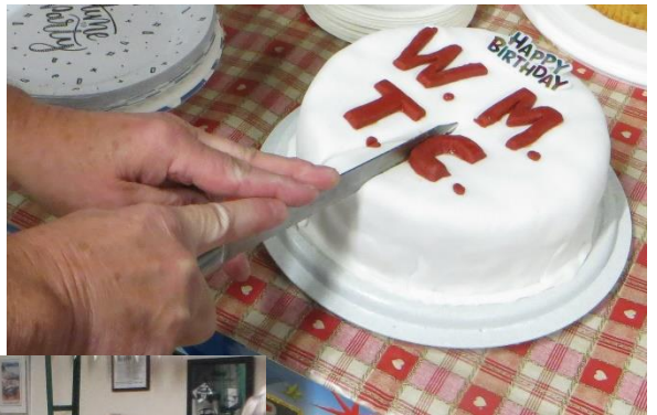
<<< ...and performs the cutting of the cake! >>>