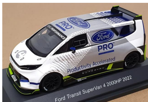
... And on the right: Supervan 4 !

Many thanks to everyone who contributed to another super WMTc night, with lots of very interesting stuff to see!