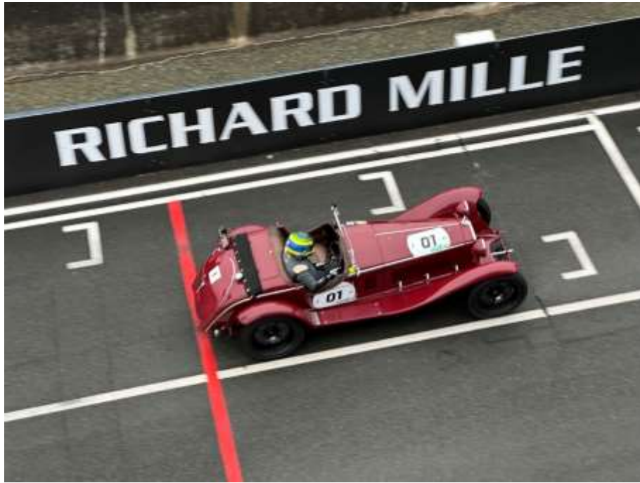
Alfa Romeo 8C 2300 Spider Zagato 1932