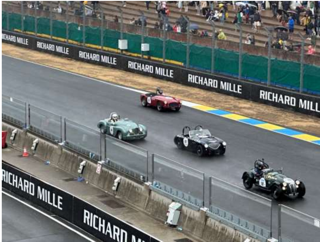
AC Ace Bristol, Jowett Jupiter 1951, Austin-Healey 100 S 1954 and Frazer-Nash LeMans Replica 1953