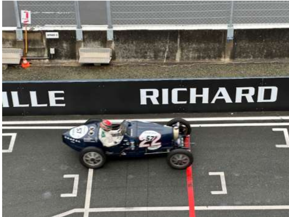
Bugatti T35 B, 1926!