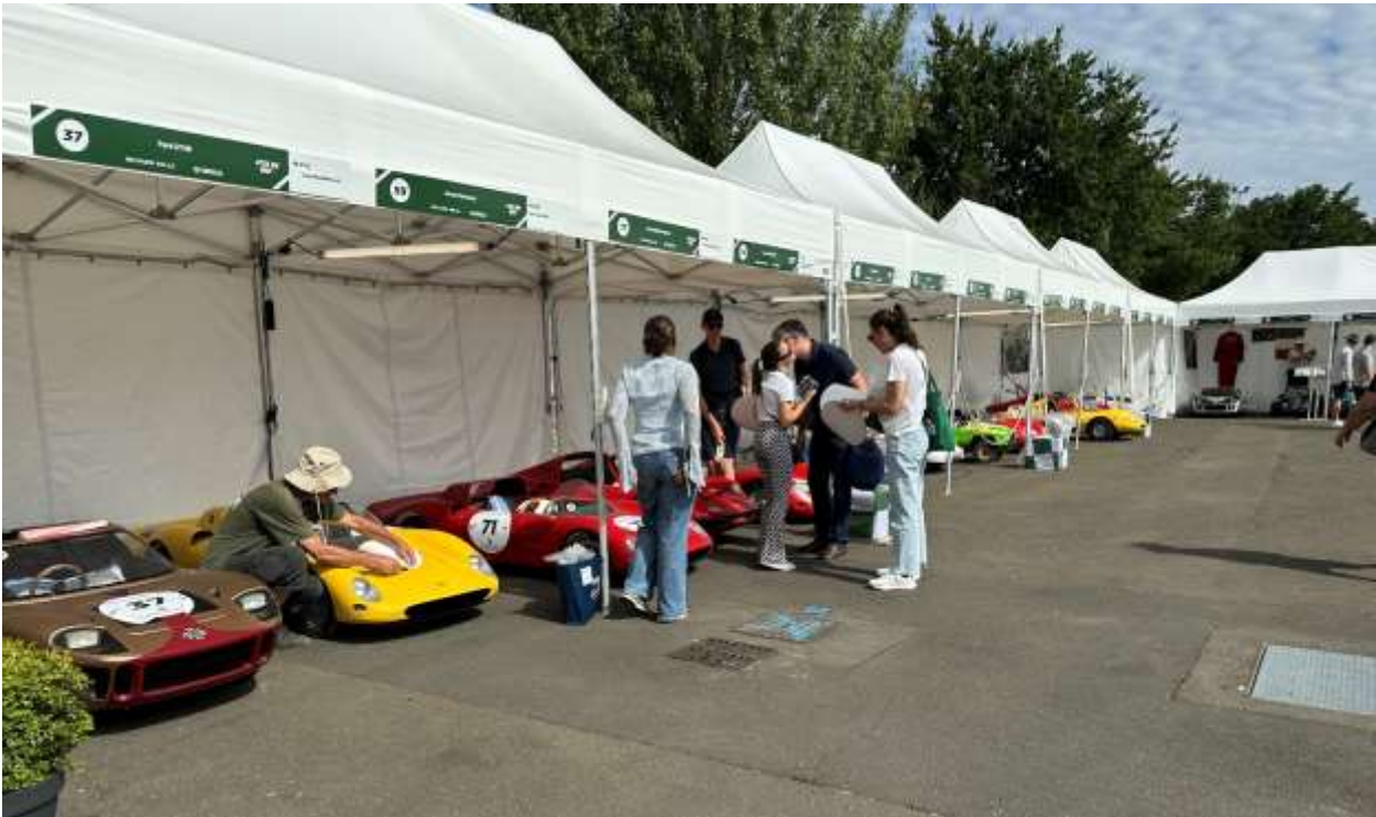
Little Big Mans Paddock