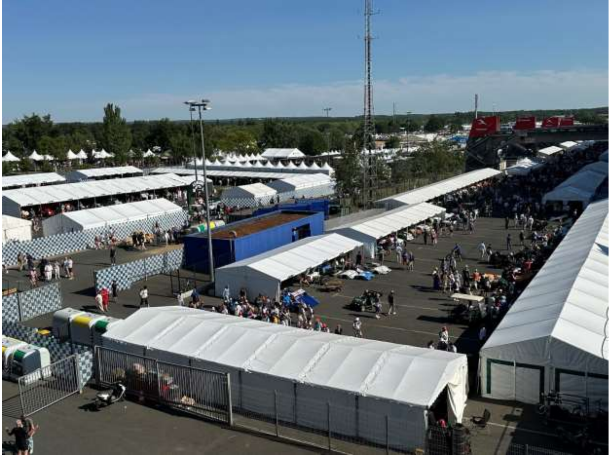
Some of the paddocks...