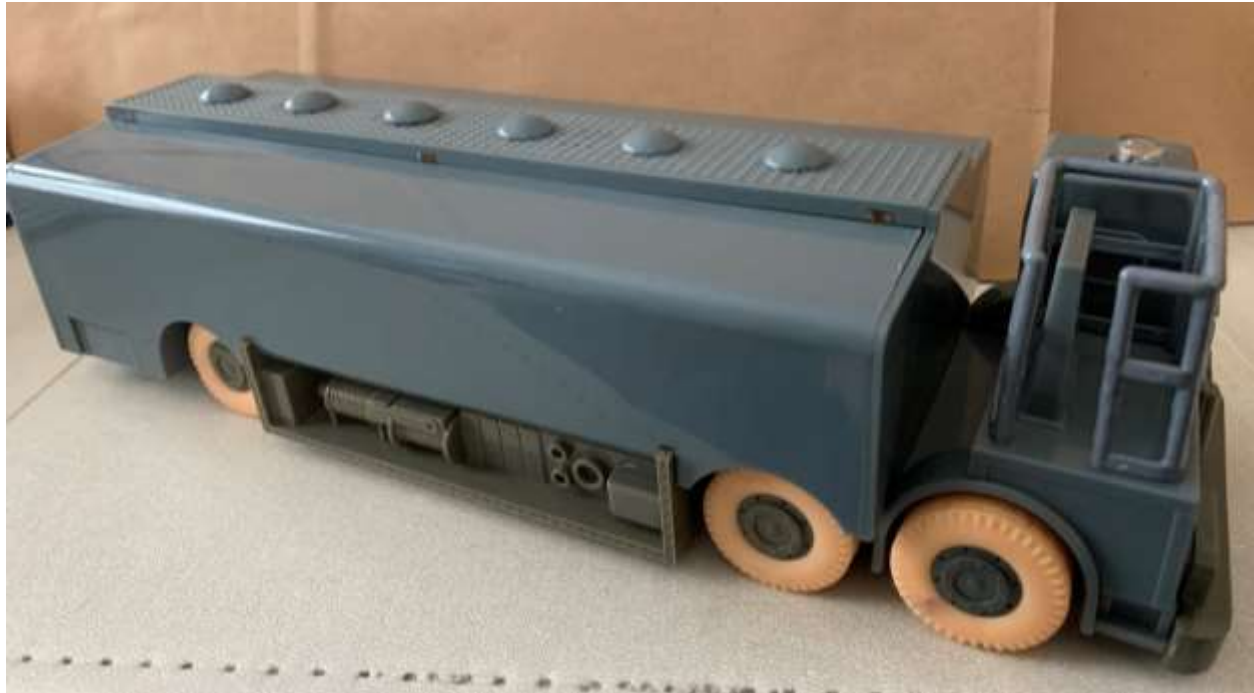
Left side of AIR BP PREPRODUCTION prototype sample. White mark on side is light reflection...this sample model is "mint" in condition!