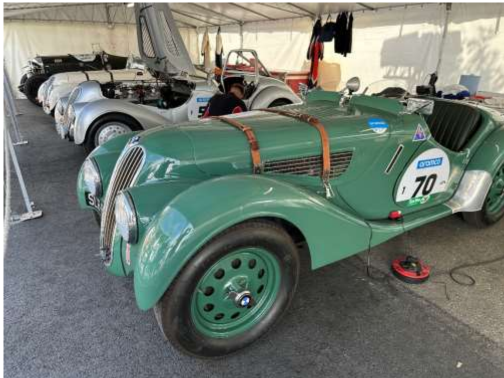
BMW's were big also...