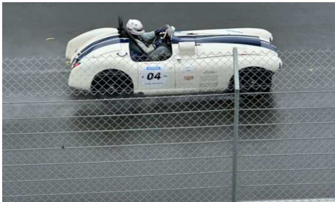
Cunningham C-4R 1953