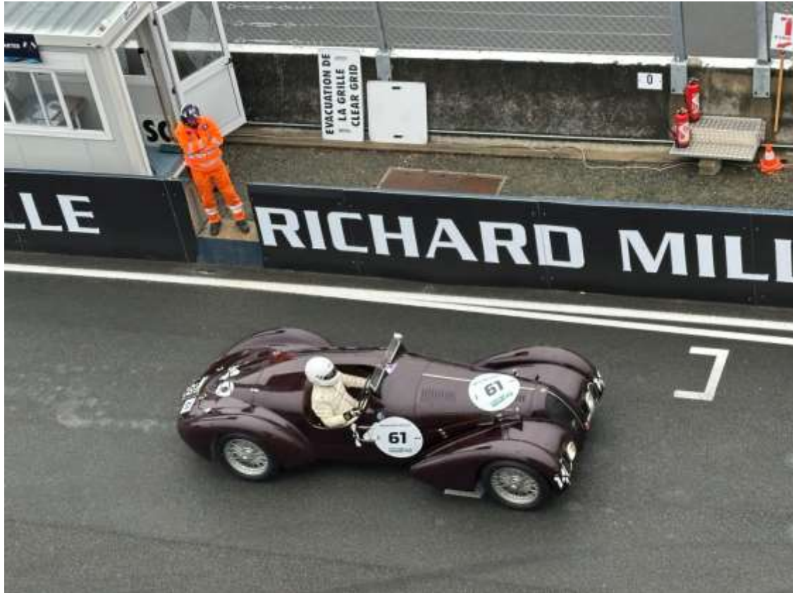
Alfa Romeo 6C 2300 B 1938