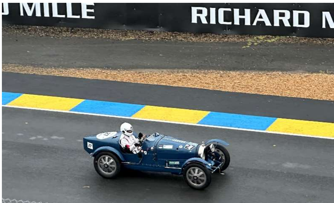
Bugatti T35B 1926