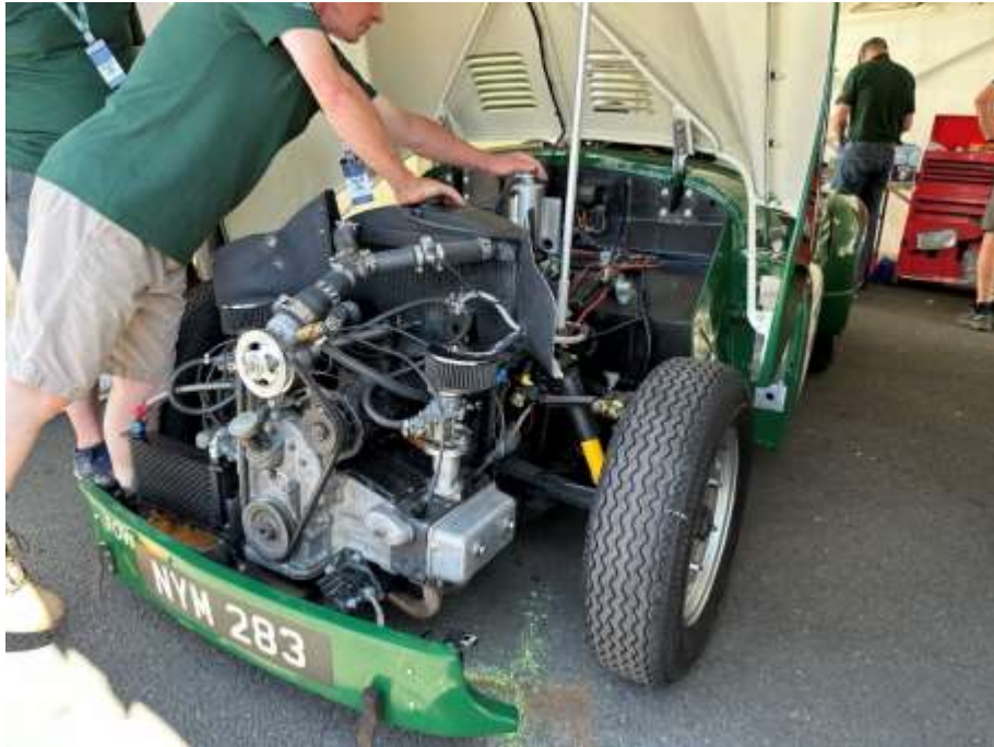
Jowett Jupiters actually placed well in several years in the early 1950's...