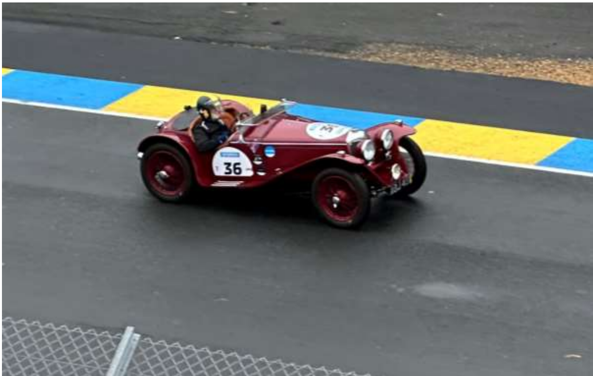
Riley Imp 1934