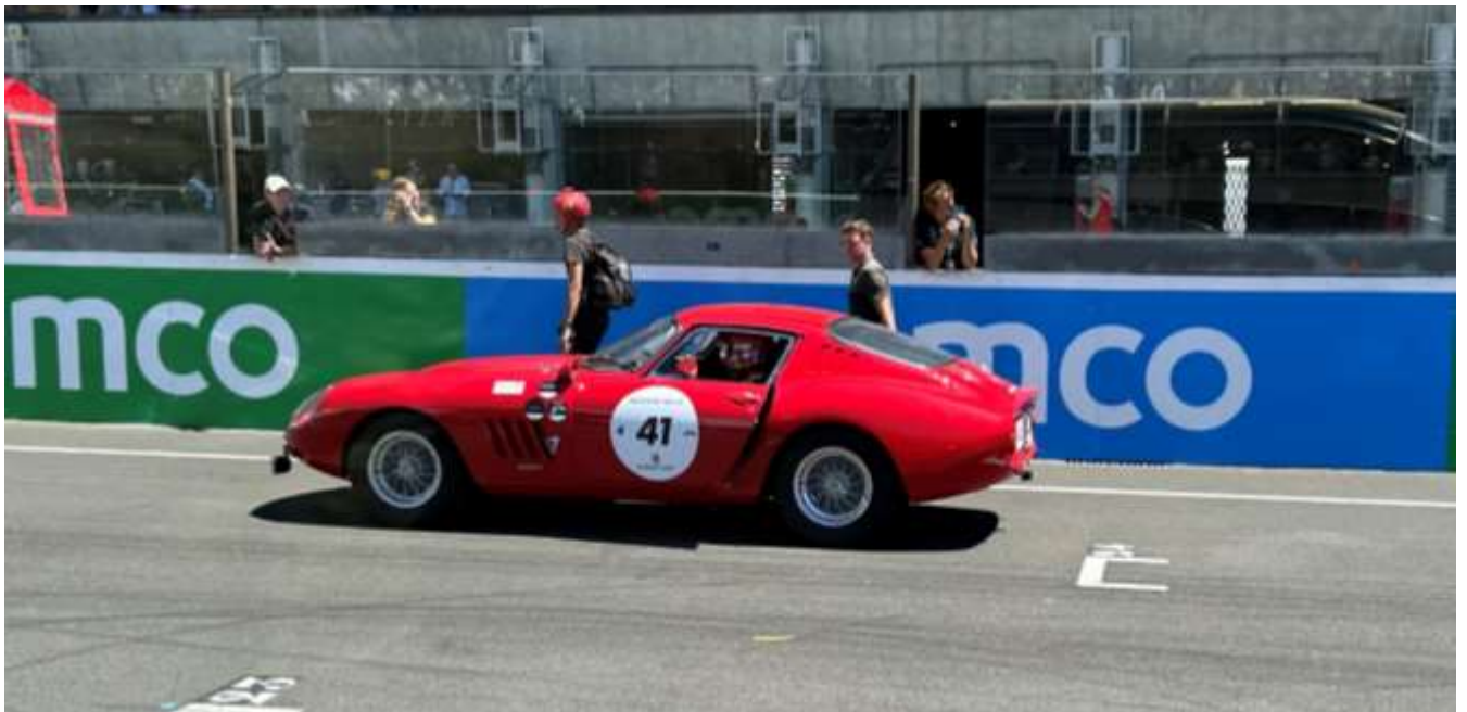
Ferrari 275 GTB/4 1966 getting into position for Le Mans start, door open because it was HOT.