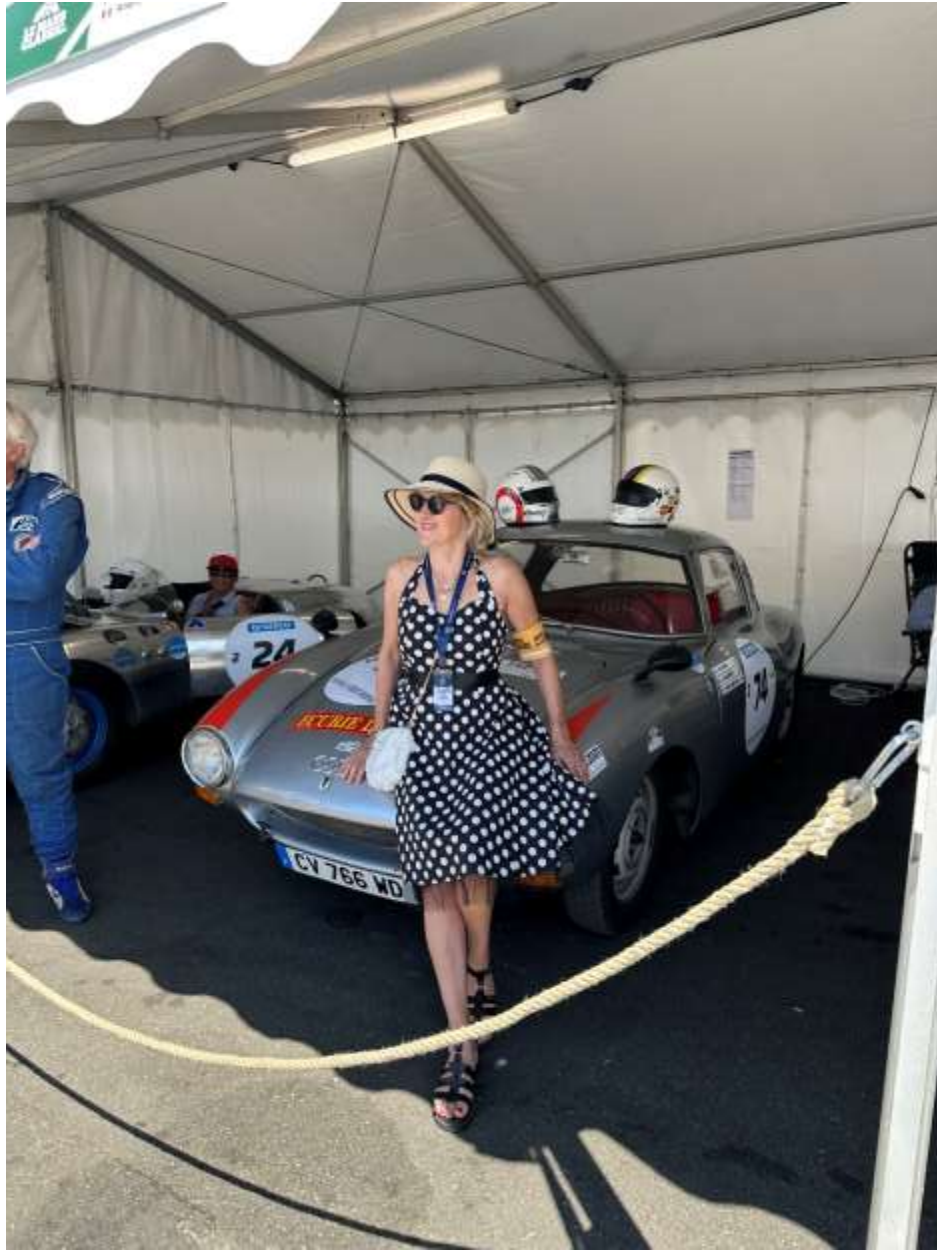
Not sure what kind of car....