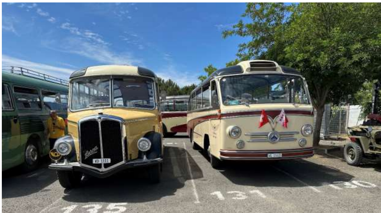
Part of the fleet of antique buses, also WW II jeep.