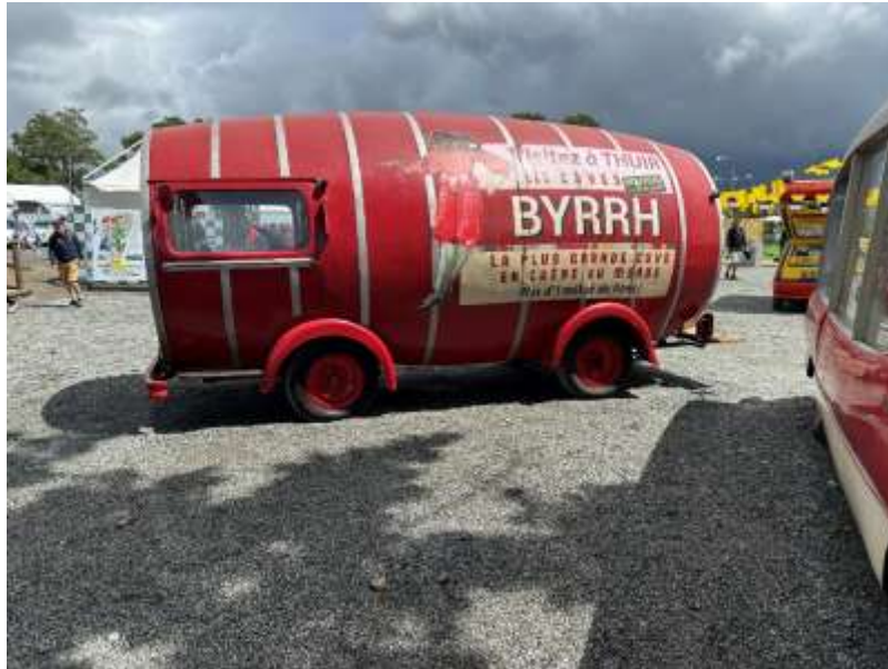
All sorts of interesting Tour de France advertising vehicles on display