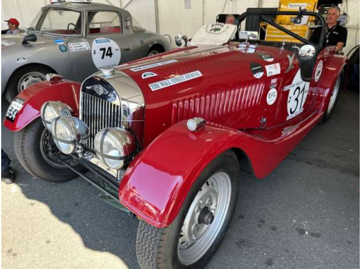
Morgan 4/4 1937