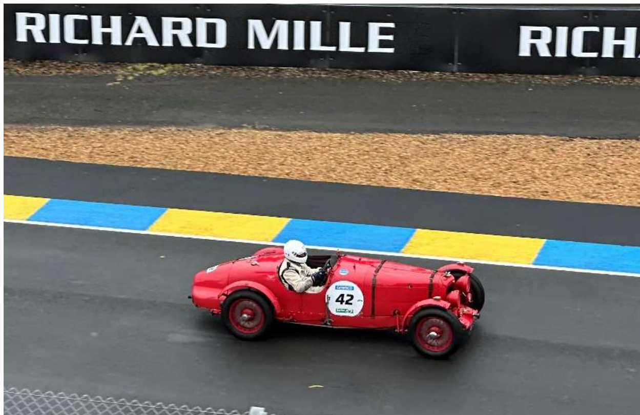
Aston Martin Ulster 1936