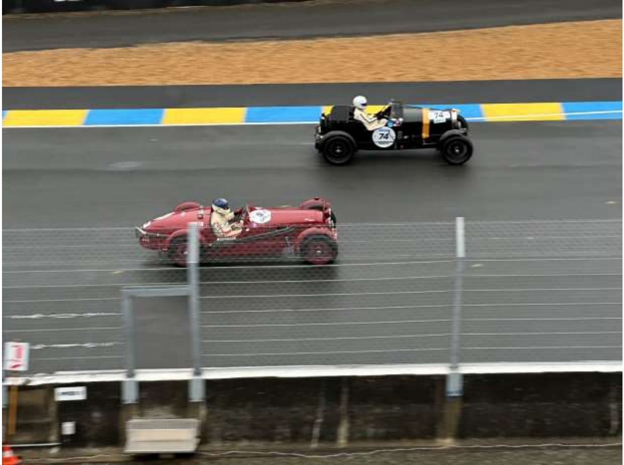
Aston Martin Speed 1937 (red) and Bugatti T44 1928