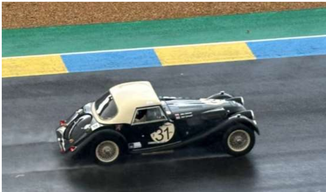
Morgan Plus Four Series 1 1953