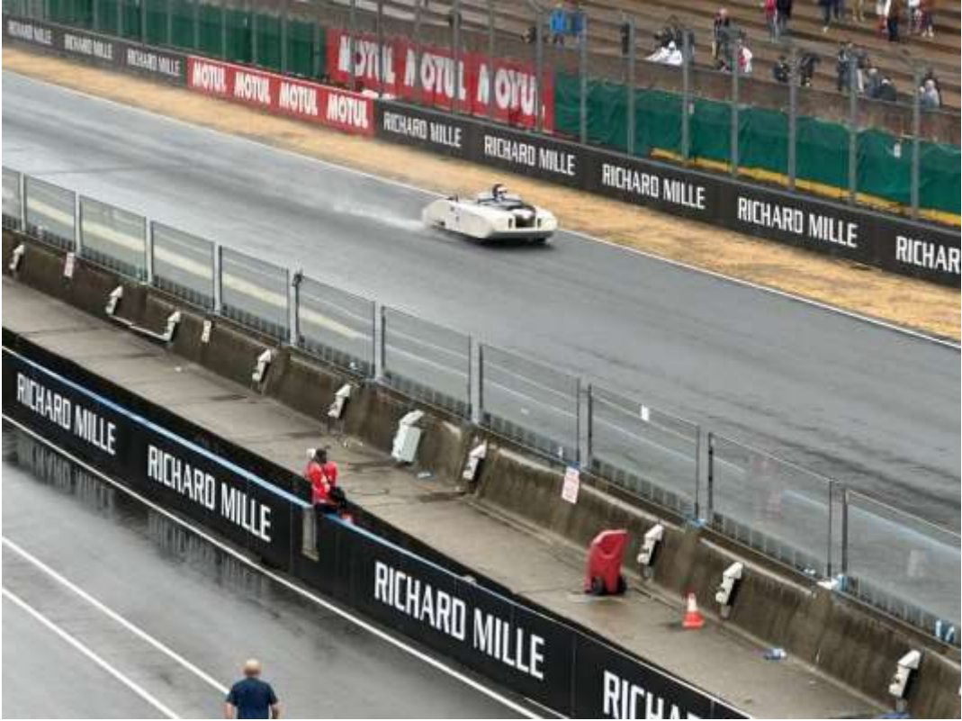
Cadillac Le Monstre 1950